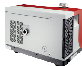
ASM 340 I