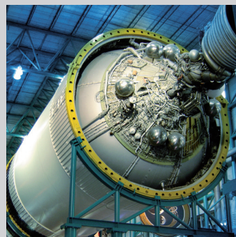
Research & Development