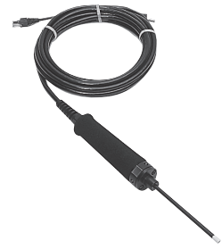
Sniffer probe LP 505