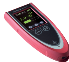
Remote control RC 500 WL

As an extension range, the ASM 340 exists also without a backing pump. This ASM 340 I allows to connect a different backing pump, for even more convenience and/or better adaptation to customer application, as for example in case of integration into a leak detection system. The connection for the external backing pump is located at the rear of the leak detector.